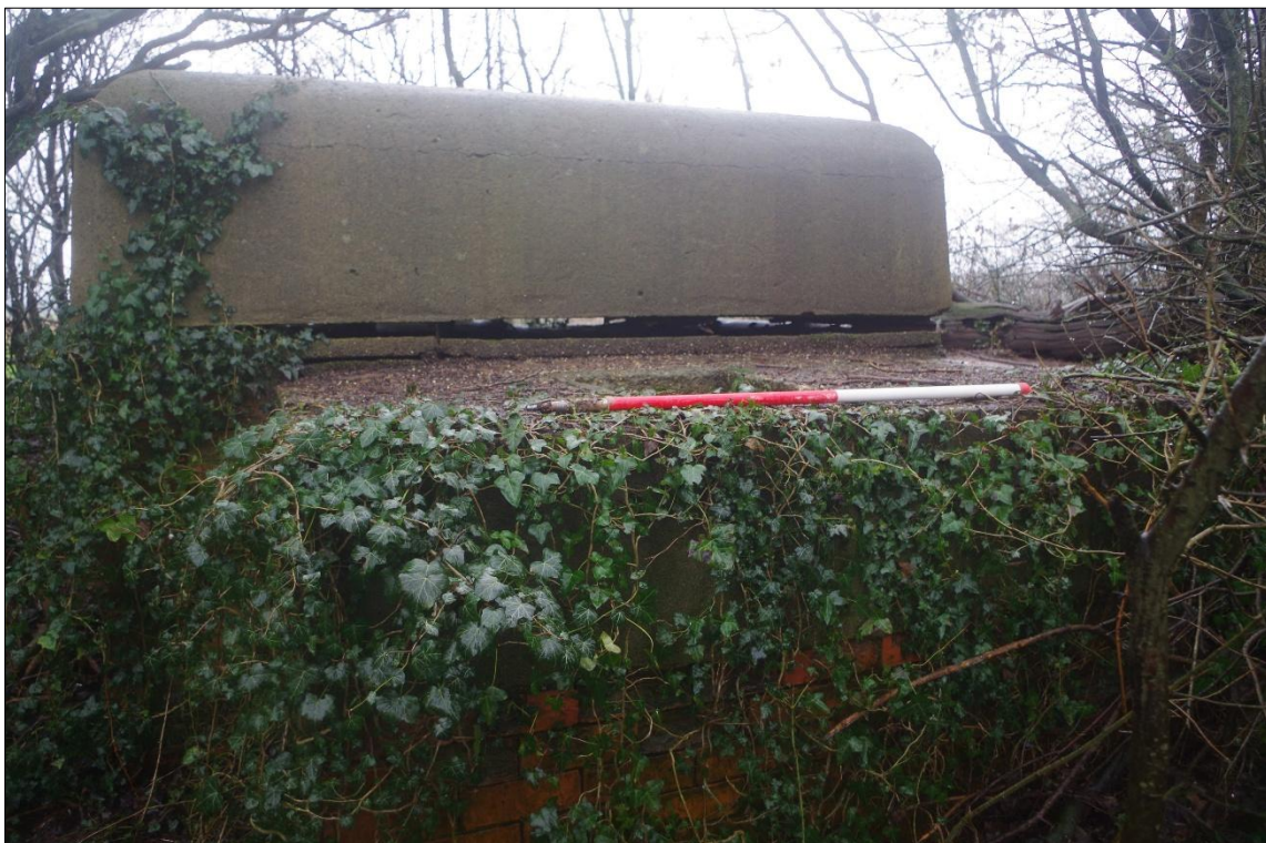
Plate 5) View of the former battle headquarters, facing north