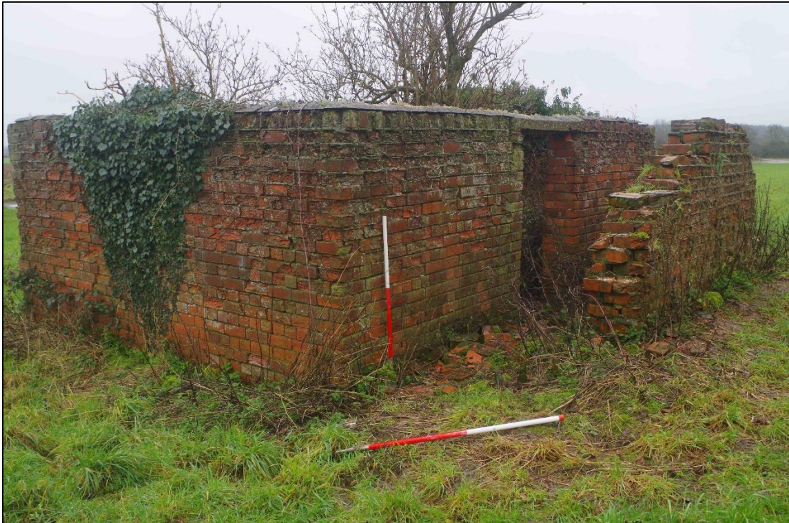
Plate 6) View of the M&E Plinth building, facing north