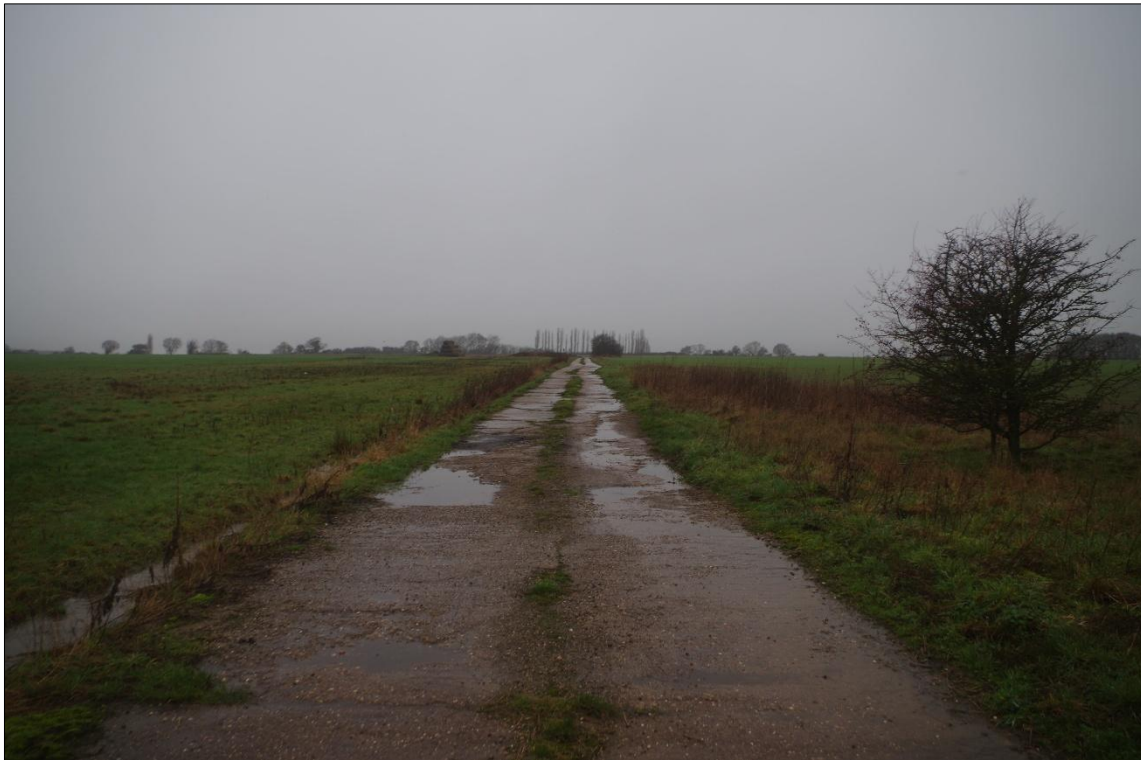
Plate 2) View of what remains of the former northwest-southeast aligned runway, facing northwest