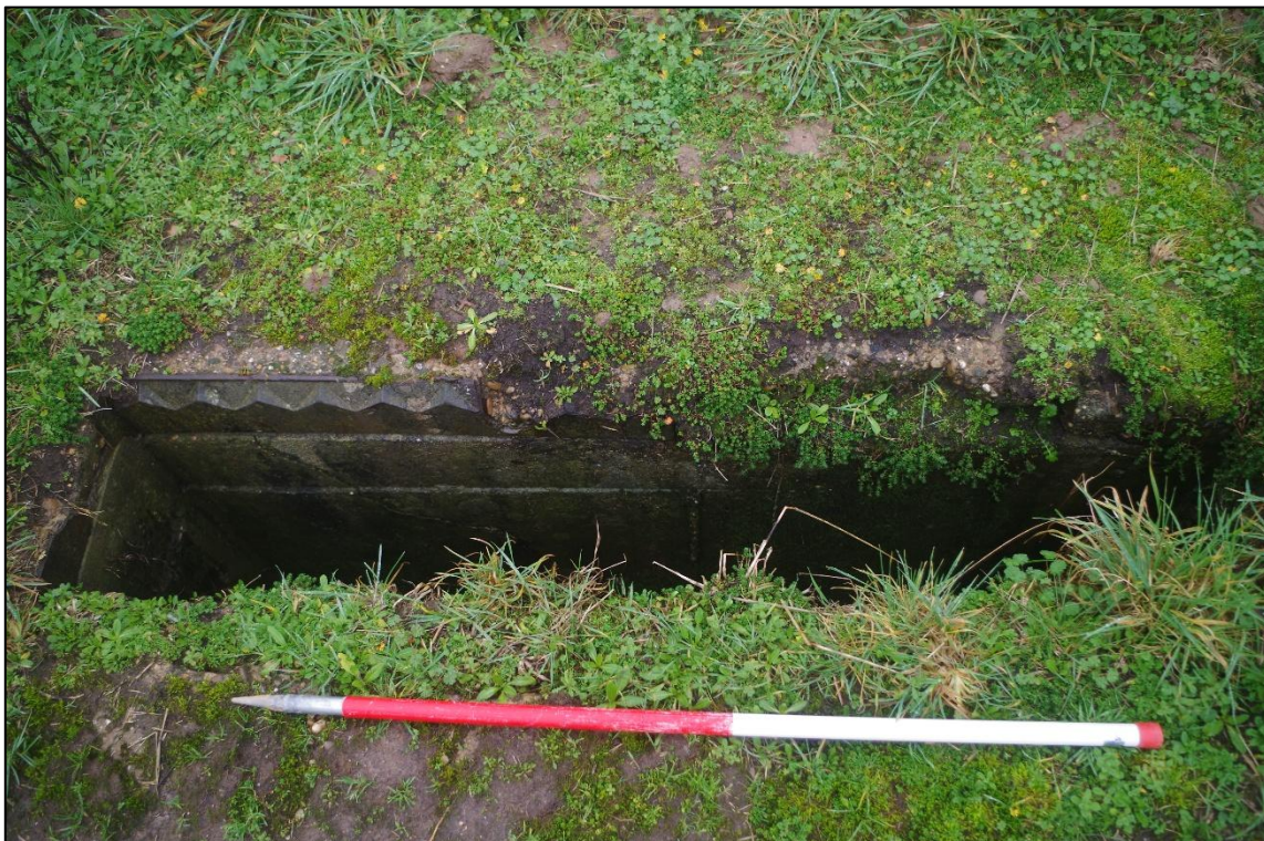
Plate 3) exposed section of the former northwest-southeast runway drainage, facing northeast