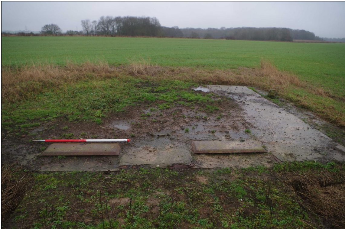
Plate 4) View of the eastern area of hard standing used as part of a possible arresting gear system, facing northeast