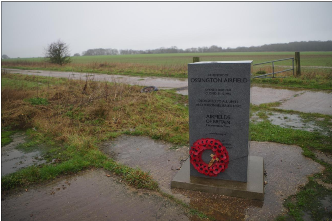
Plate 1) View of the memorial located adjacent to the Order Limits, facing northeast